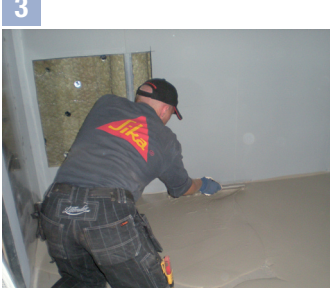
Application of Sikafloor® Marine-100 or -120 Sikafloor® Marine-100 or -120