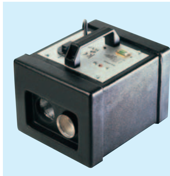
Cartridge warming oven

For detailed information and guidance on the design of application equipment please contact your local Sika technical consultant.