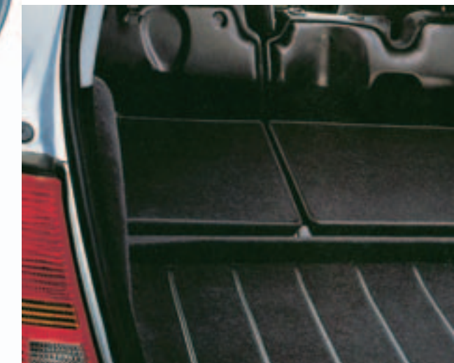
Bonding carpeting in vehicle cabins