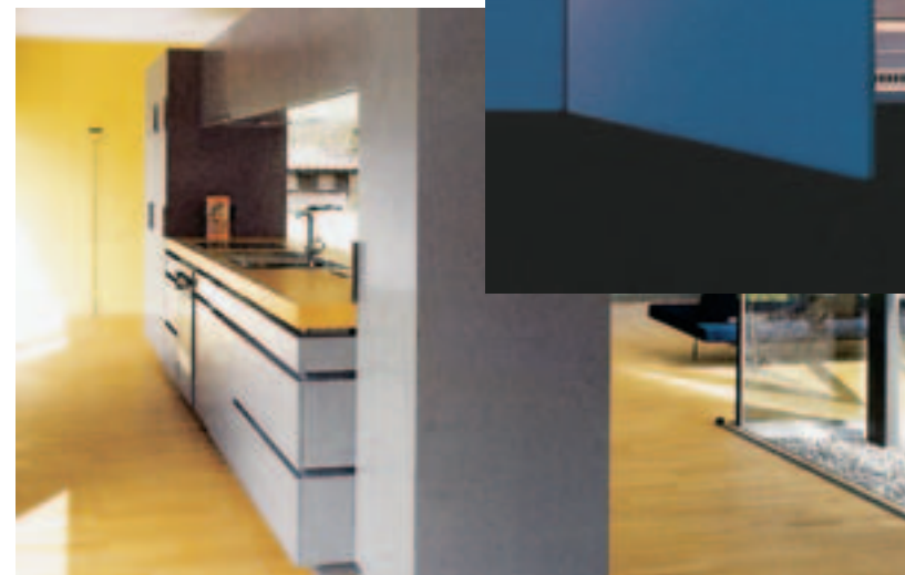
Decorative furniture facings