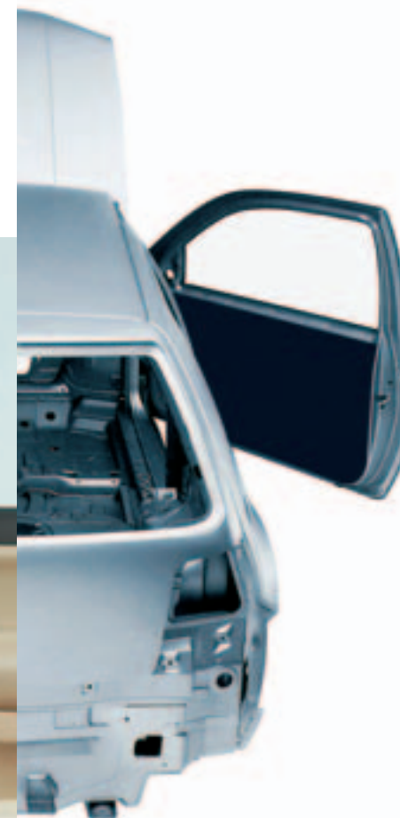
Fast assembly of door panel trims and retaining clips with the aid of reactive hotmelts